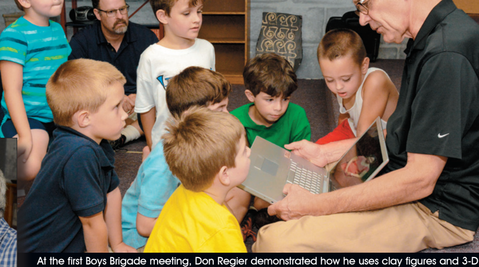
images to illustrate character qualities. Each boy was assisted in molding a clay figure of his own.

Volunteering as a Boys Brigade Buddy requires little more than love and patience.