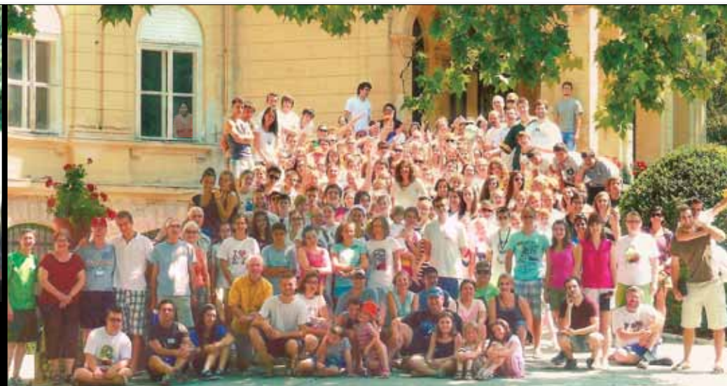
Team Two braved 102-degree weather to share the love of Jesus in English Camp and Baseball Camp. They witnessed God's amazing work in the lives of the 150 children and camp workers/volunteers (pictured above).