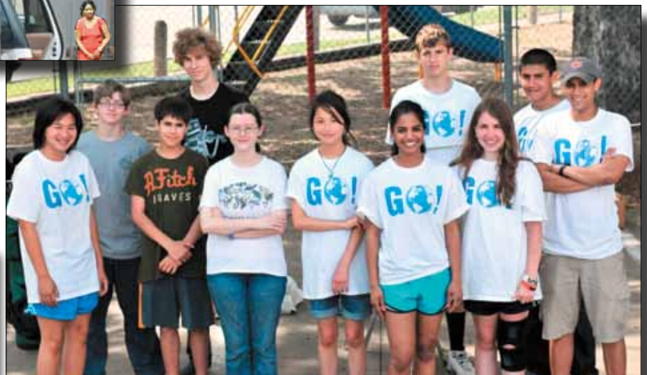
Some of the proceeds will enable our youth to GO! serve in South Texas