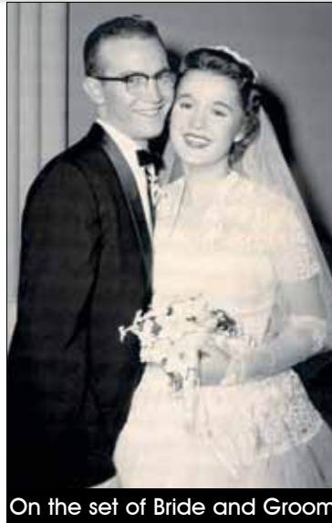
On the set of Bride and Groom

after serving in various engineering management positions.